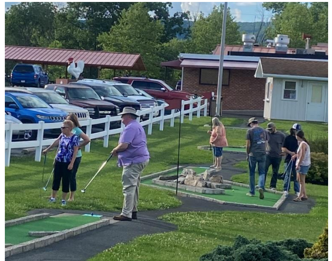
Mini golfing at Kauffman's on June 25, 2023.