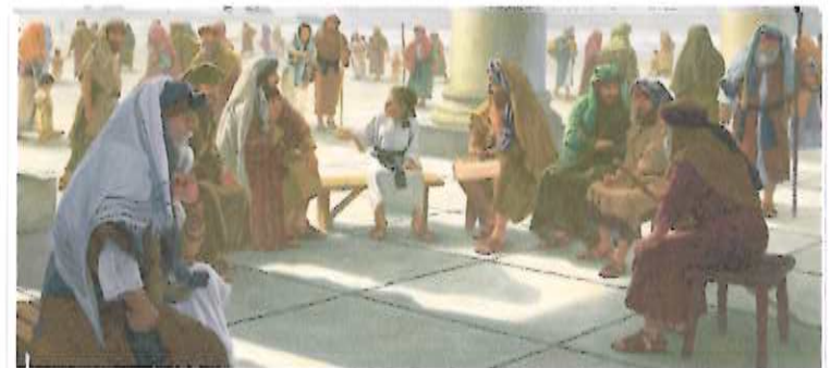
The boy Jesus in the temple. Luke 2:41-52