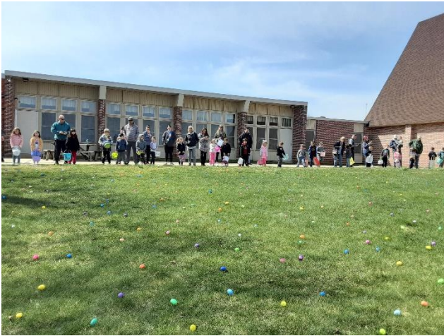
Egg Hunt: 3, 2, 1.... GO!