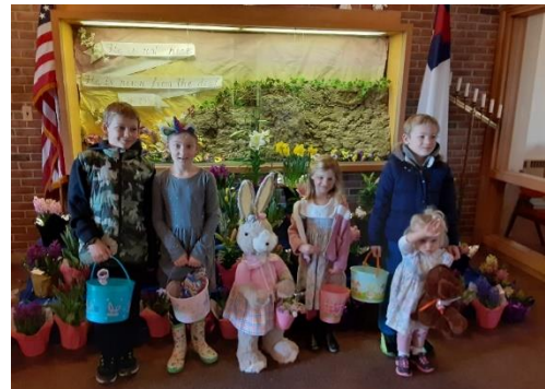
Keener family with egg hunt prizes.